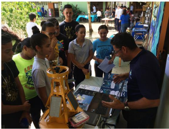
Science Week Exhibit