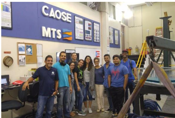
Meteorology Society of PR