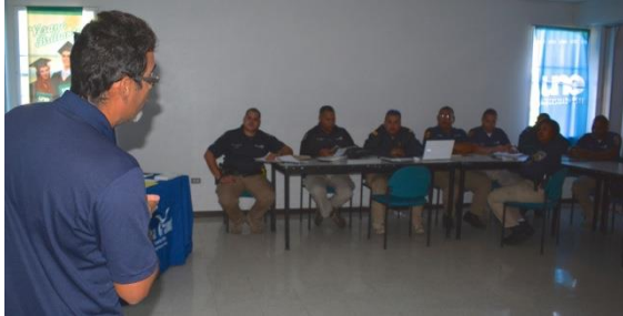
FURA Workshop at UNE