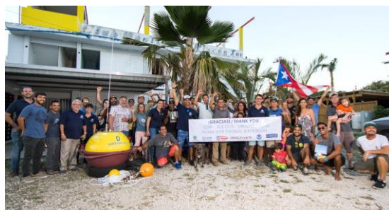
Rincon Buoy Ceremony